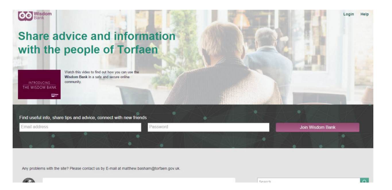
Home page of the Wisdom Bank-Torfaen