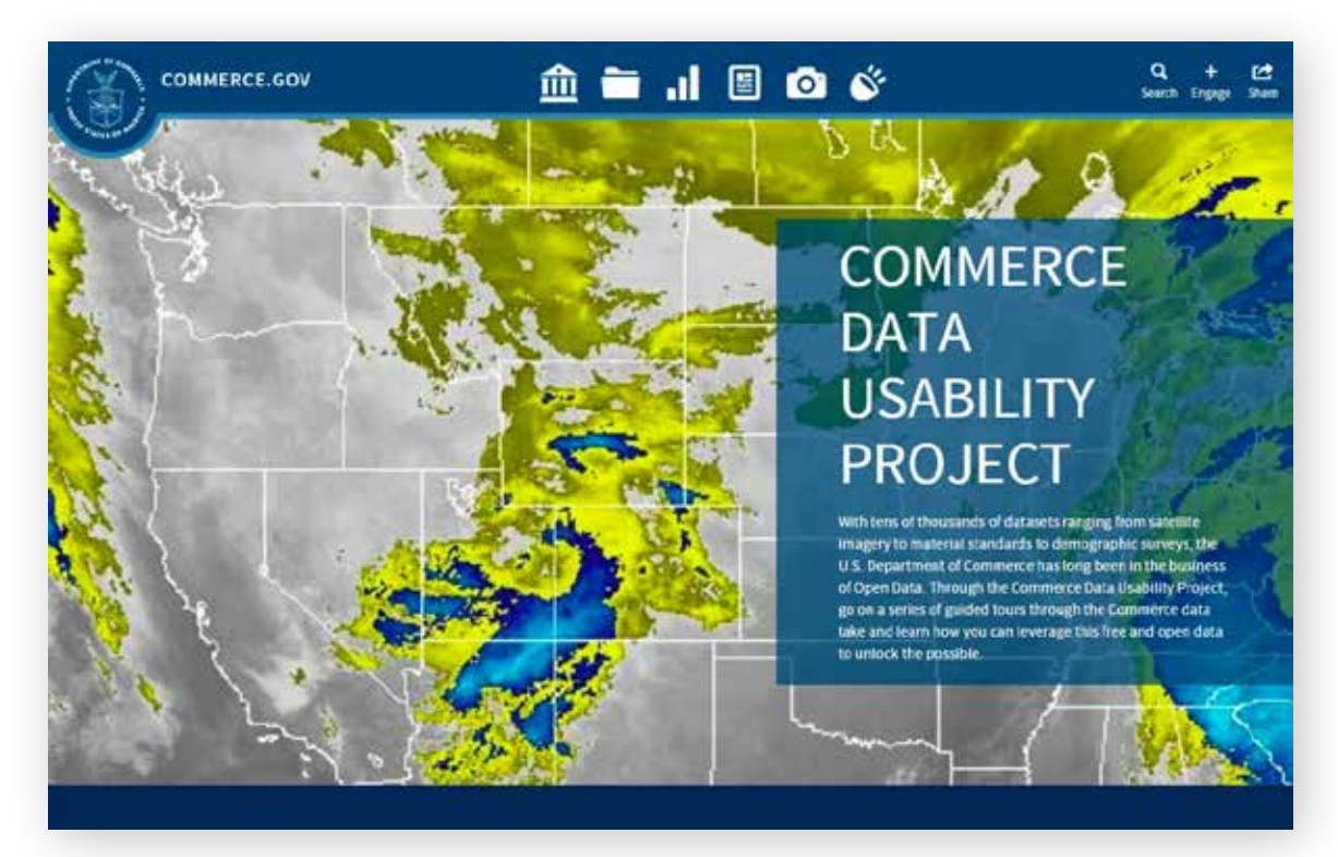
Figure – Commerce Data Usability Project Website

Organised around a new shared services model, the Data Service tackles core infrastructure issues around the Commerce Department and helps enrich human capital.