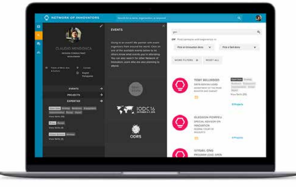
Figure–Network of Innovators